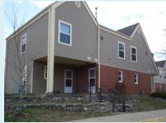
The Gardens at Flint Hills

LIHTC stands for Low Income Housing Tax Credit. LIHTC housing developments are built with public and private funds, with supervision from state and other compliance agencies. By having public and private funds working together, LIHTC communities can offer great apartments for below market rents!