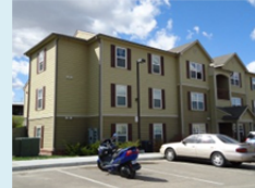
Flint Hills Improvements