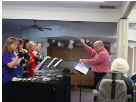
The First Lutheran Church Hand Bell Choir performs at the 2011 Resident Holiday Social